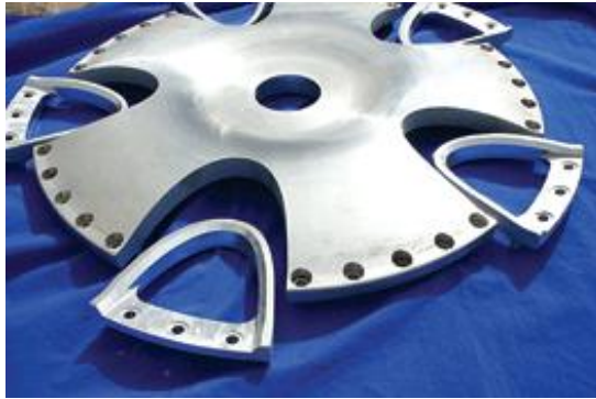
Aluminum Machined Using Water Jet